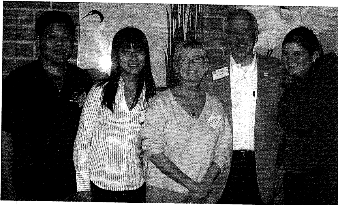
IOWA Section IFT Scholarship and Award Winners for 2009!!